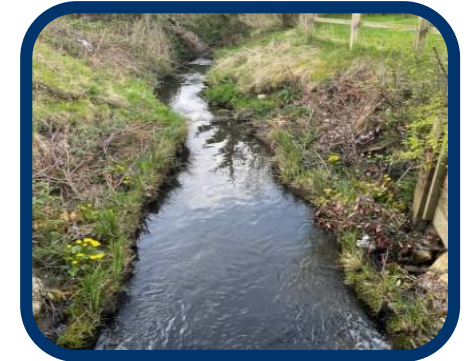
Coir Roll establishment after 7 months