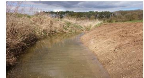
Shortly after construction with re-profiled ledge flooded

DID YOU KNOW? The Pessall Brook at Coton is a tributary of the River Mease which is a Special Area of Conservation – one of the highest designated habitats in Europe.