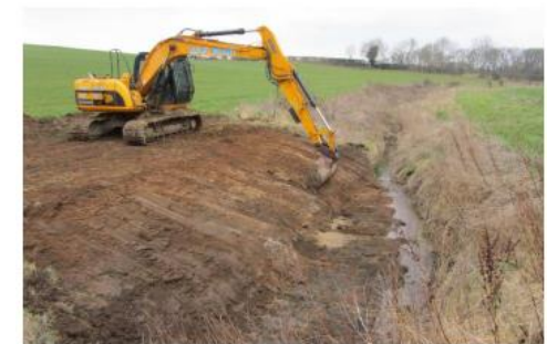
During construction, showing low flow channel and dry ledge