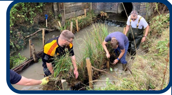
Example of Coir Roll Installation