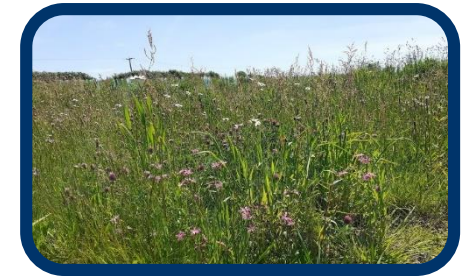
Example of species mix to be used for planting

We would love to hear from you with any comments /feedback /concerns /questions or ideas about the proposed works and/or the planting and management.